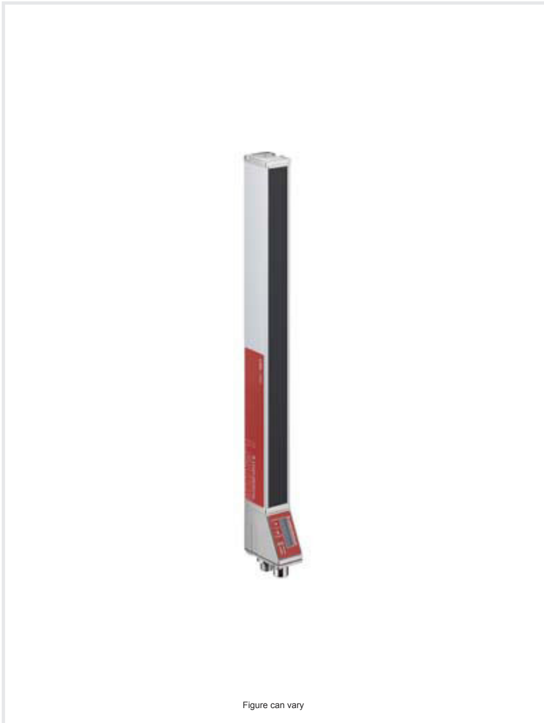
Figure can vary