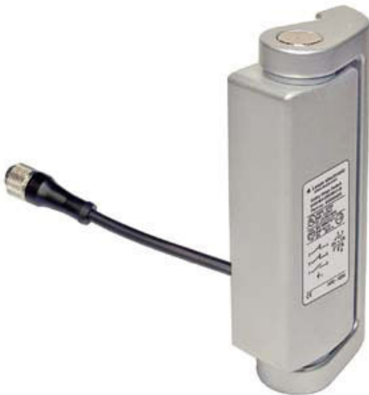
Figure can vary