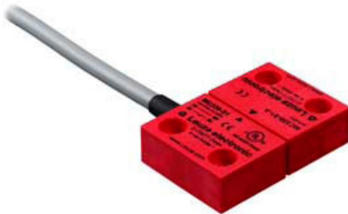
Figure can vary