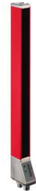
Figure can vary