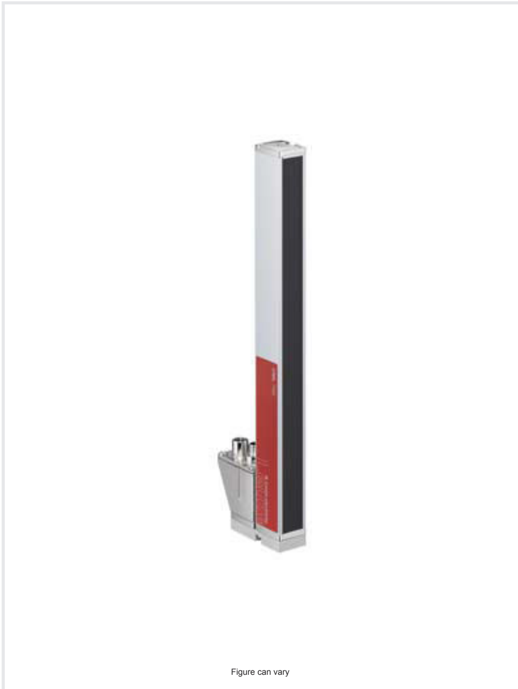
Figure can vary