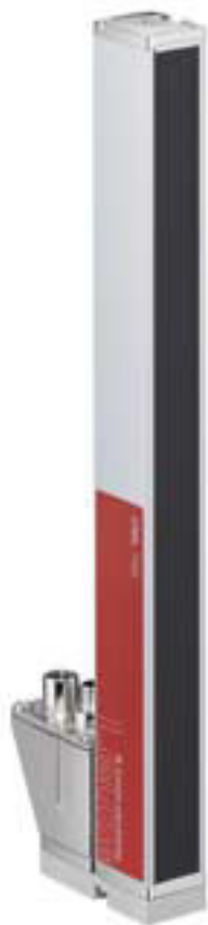
Figure can vary