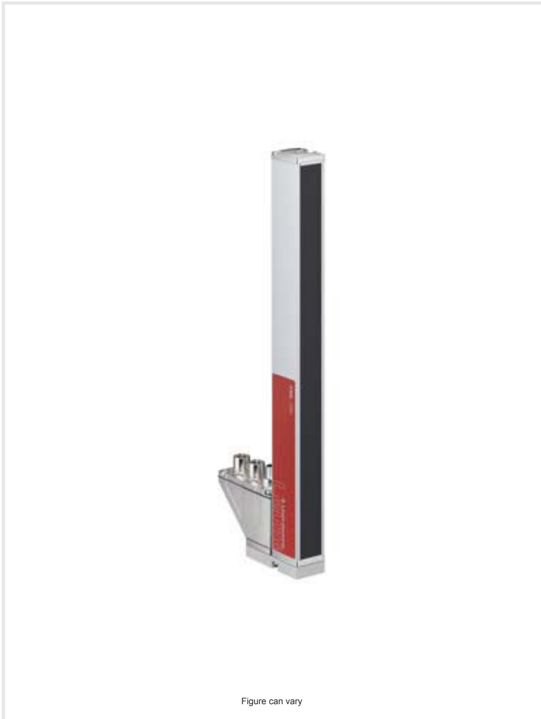
Figure can vary