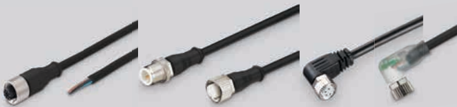
Connection and interconnection cables M8 and M12

Various materials and function ranges offer an appropriate solution for every application.