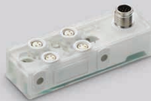
Distribution box M8 ports