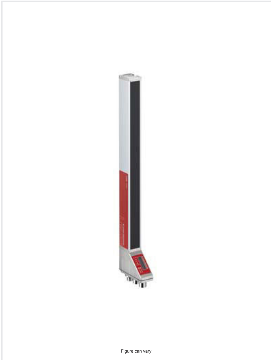
Figure can vary