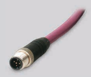
Ready-made cables for almost all interface types

Our easy handling claim starts with mounting and alignment. To ensure that the DDLS can be mounted securely and easily, we have developed matching accessories for simple mounting and connection of our devices.