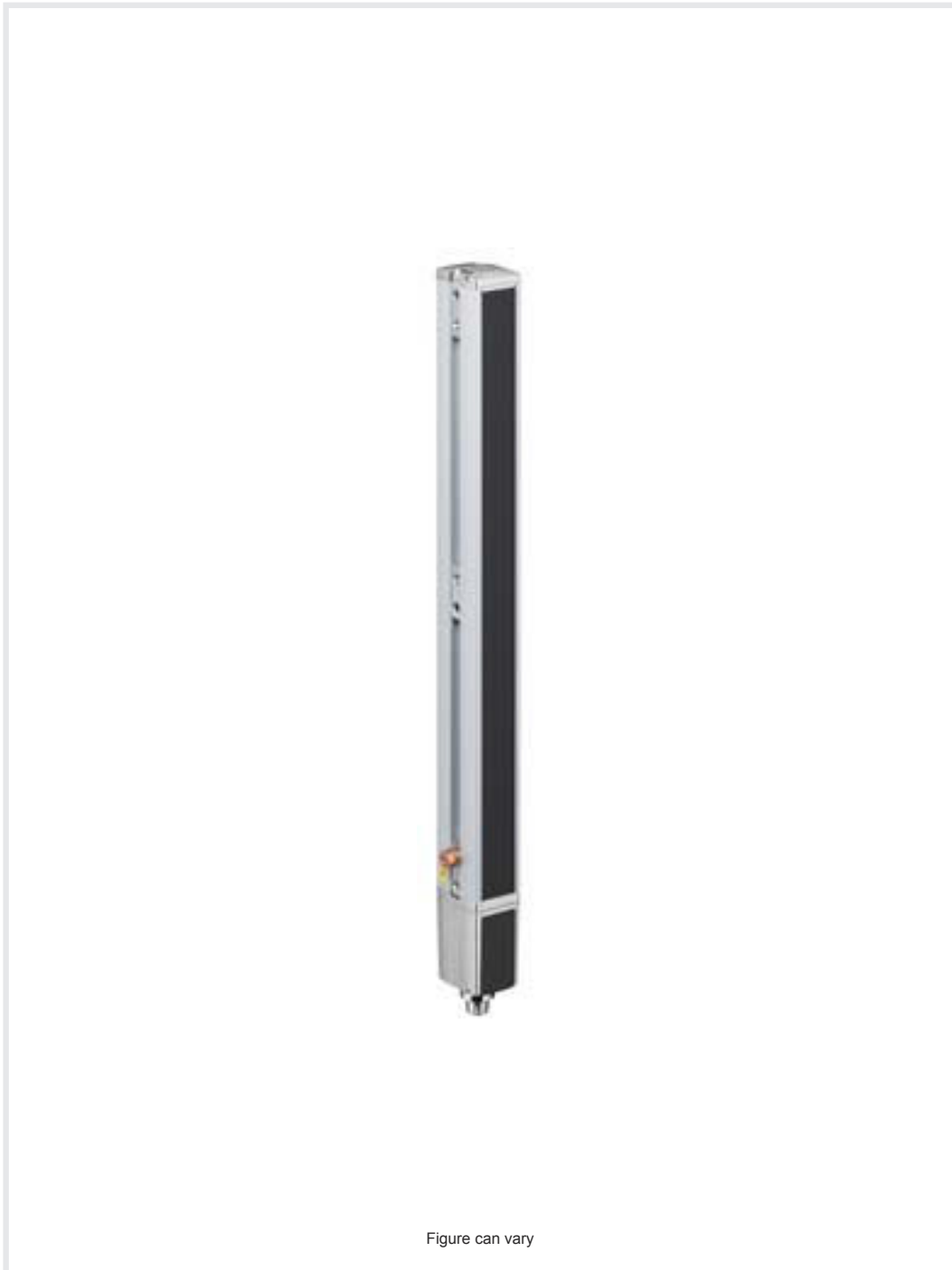
Figure can vary