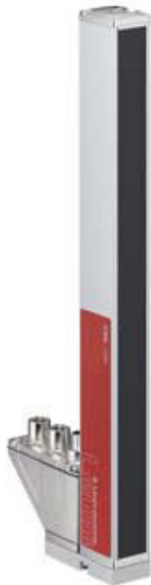
Figure can vary